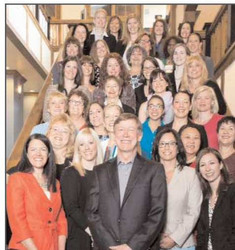
Colorado Governor John Hickenlooper (center) with members of the CWBA and CWBA Foundation Boards of Directors